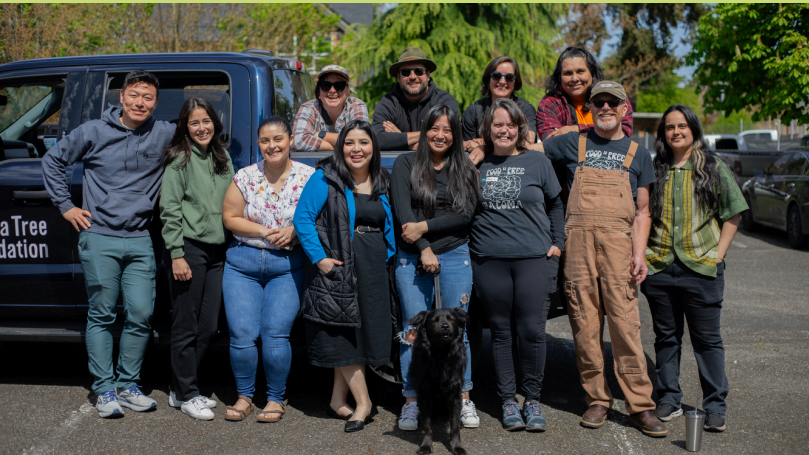
Photo: Food is Free Tacoma, Mi Centro, and Tacoma Tree Foundation at the Día de la Tierra tree and food share celebration on April 23, 2024.

Our fifth planting season has concluded! The season began under the annular eclipse on October 14, 2023 as we gathered with residents of McKinley Hill, our Community Tree Partnership team, and volunteers. It concluded with our last tree share of the season in collaboration with Food is Free and Mi Centro. Partnerships have been an overarching theme this season. As we have grown, so have our collaborations. We have been honored to learn from and support the efforts of sister organizations, who share our vision for a cohesive, healthy, and green Tacoma. Thanks to everyone who joined us this season! We're excited to head into summer, when we'll be caring for the young trees we planted, and hosting events that support tree care education and appreciation, access to the outdoors and wellness. We'll see you out there!